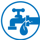
Protection from pipe-water