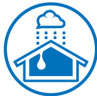
Protection from rainwater